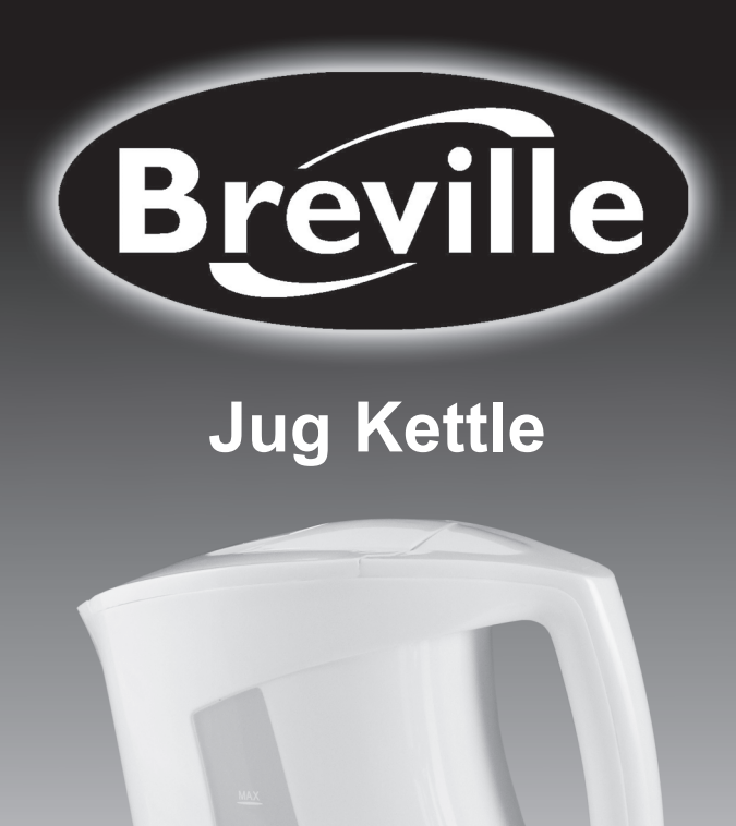
Instructions for Use

PLEASE RETAIN THESE INSTRUCTIONS FOR FUTURE REFERENCE. These instructions refer to the Breville Kettle VKJ179